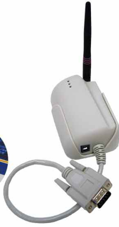
Serial Bridge (shown w/bracket)